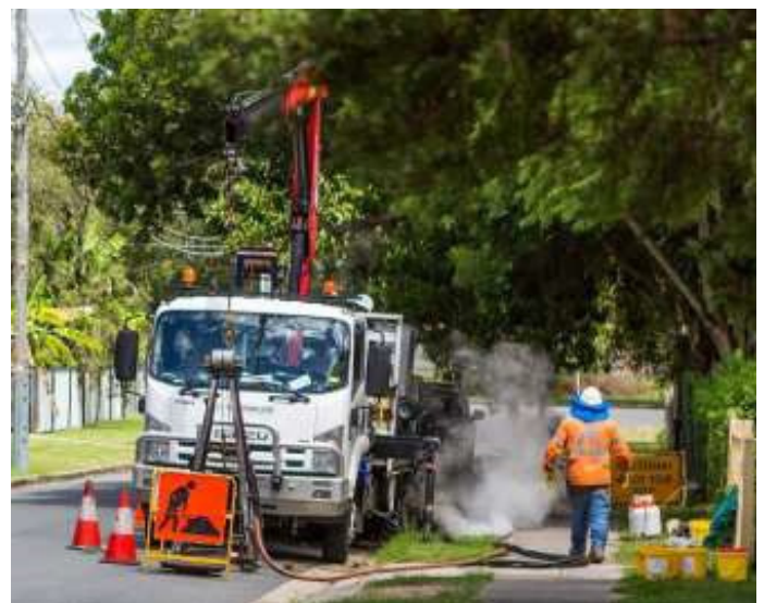
Abergeldie uses steam to cure a new liner in a section of pipeline.

Council appoints contractors as they have the specialist equipment, skills and experience required to deliver the works.