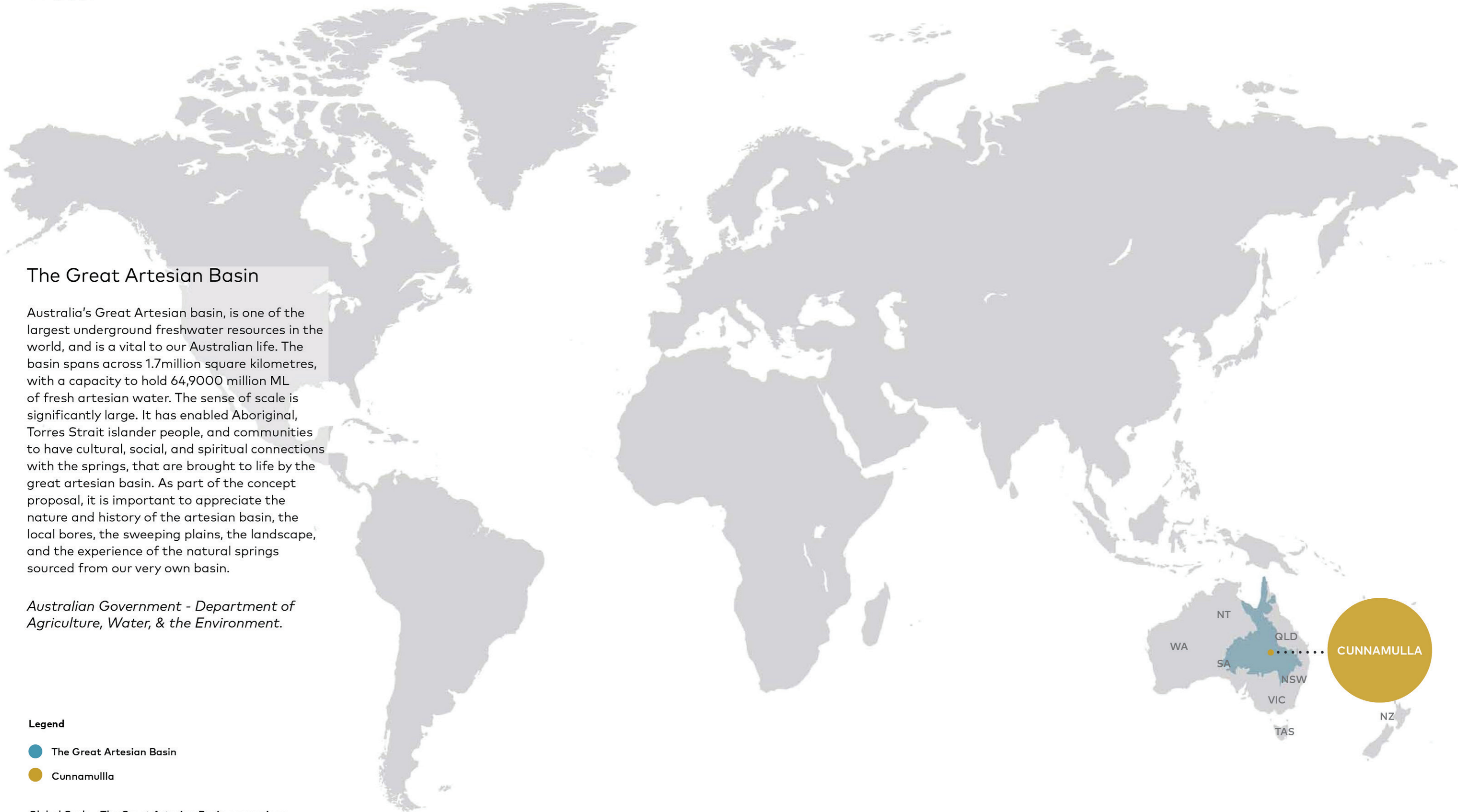
Global Scale - The Great Artesian Basin comparison